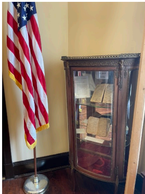
Book of Mormon Census